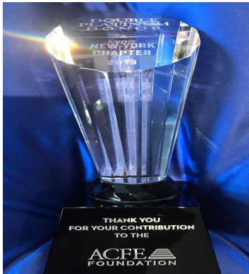
ACFE Platinum Donor Award

were from New York State! Congratulations to all the scholarship winners!